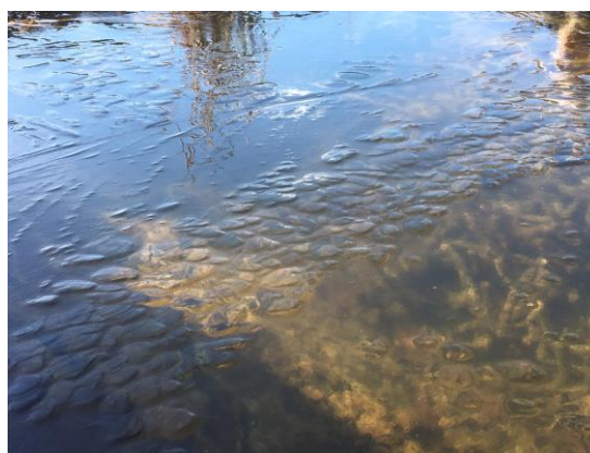
Ice patterns on the pond

Enjoy the garden at Hengistbury Head and we look forward to having a chat with you on our Wednesday mornings.